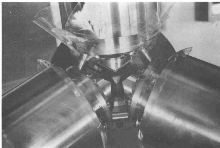
Close up of Sample Chamber